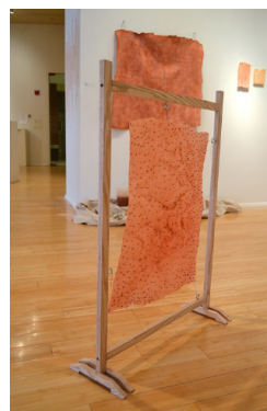
Skin Box (standing sculpture) $365