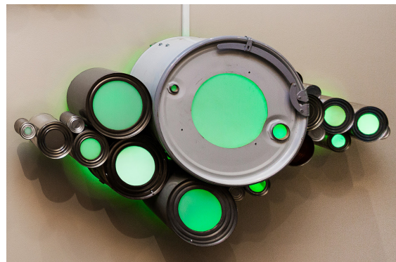
Across the Clouds (Large 2), 2018 Metal and LED's Individual: $4,000