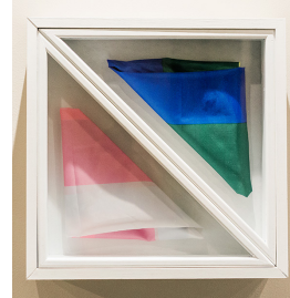
Gay/Trans Flag Box $390