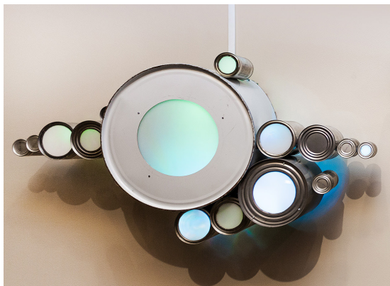
Across the Clouds (Large 1), 2018 Metal and LED's Individual: $4,000