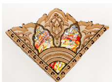
Flaming Hot 1/2, 2019 Rug cut-out, recycled Hot Cheeto bags 20 x 28 in $500