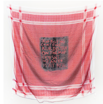
Just Because You Can't Find Kurdistan on The Map Doesn't Mean it Doesn't Exist, 2020 Ink on found fabric 51.50 x 51.50 in $350