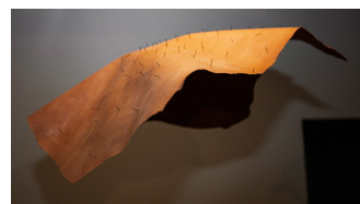
Skin Box (hanging sculpture) $350