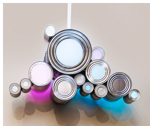
Across the Clouds (Small), 2018 Metal and LED's Individual: $3,000