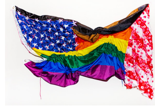
Updated Rainbow Flag, Remade $375