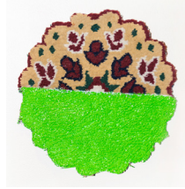
Untitled, 2020 Rug cut-out, acrylic paint 13 x 13 in $200