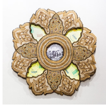
Bacon is in Everything, 2019 Found rug, xerox paper, McChicken wrappers 30 x 35 in $750