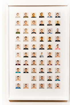
60 Days $440