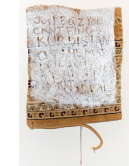
Cut from the same rug, 2020 acrylic, found rug 23 x 18 in $350