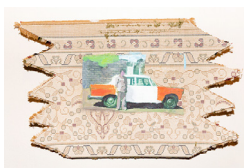
Chasing the American Dream, 2020 Found rug, xerox paper and oil paint 14 x 20 in $350