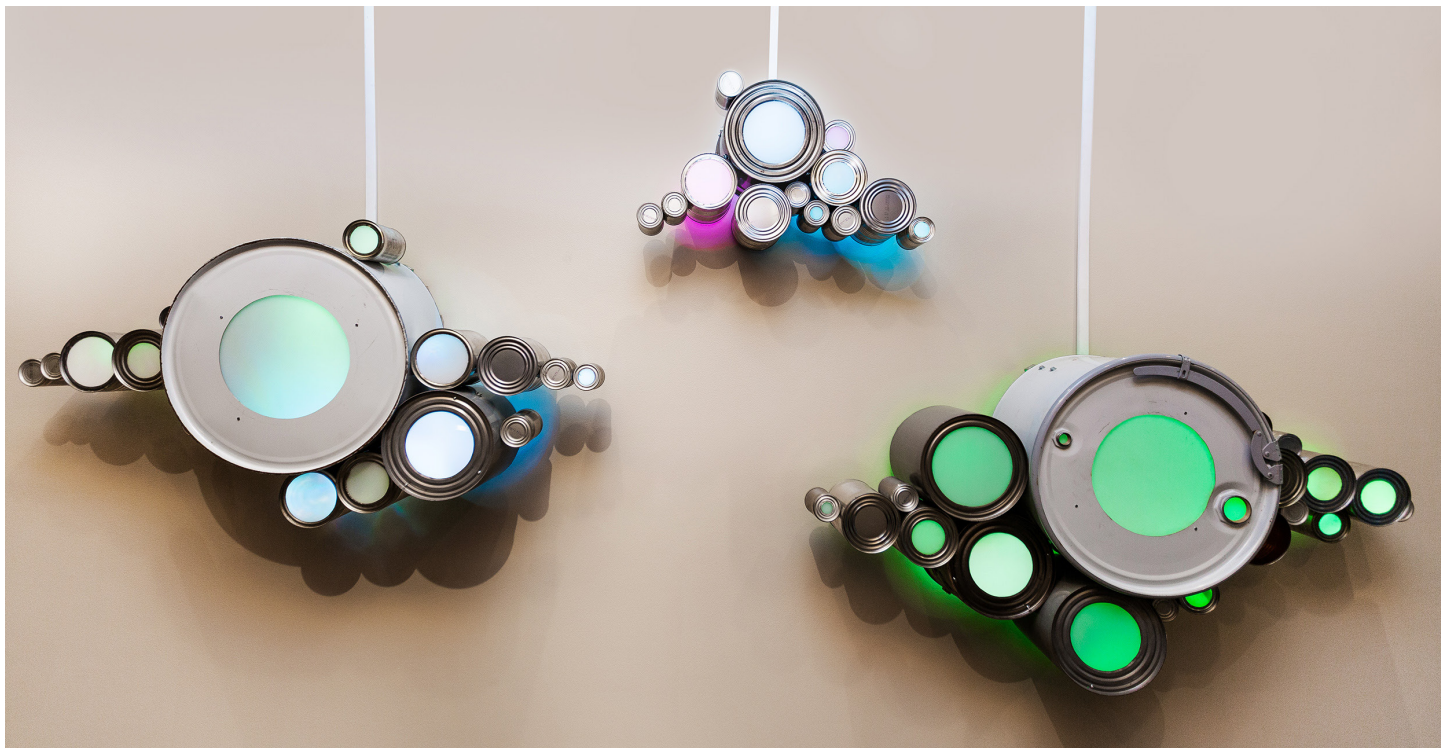
Group of three: $11,000